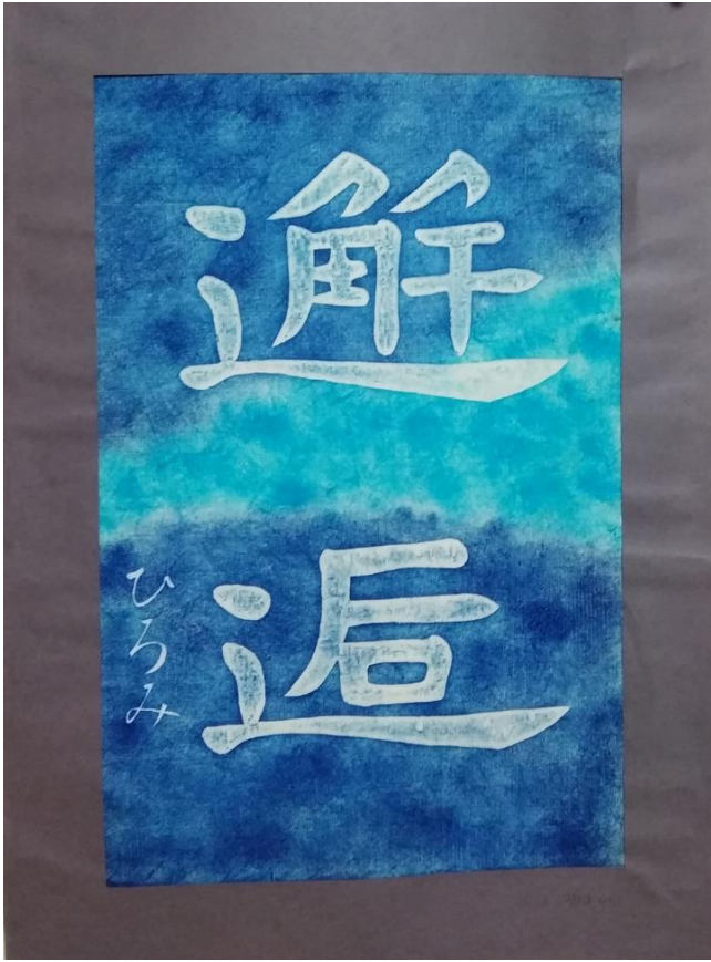
"kaikoh" -encounter- (Calligraphy print) 1999